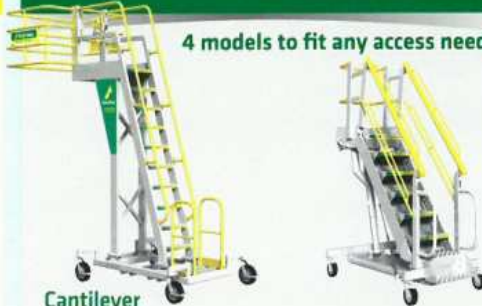
Cantilever Work Platform