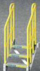
4 SAFETY STAIRS