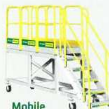
Mobile Work Platform