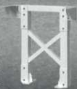
3 TOWER SUPPORTS