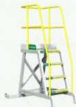
Tilt & Roll Platform